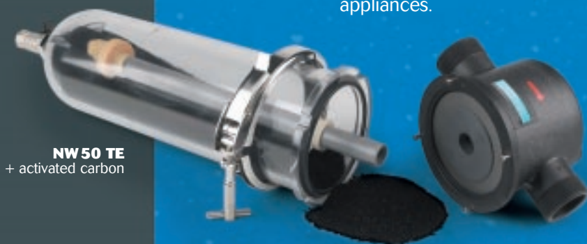
NW 50 TE + activated carbon