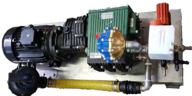
PIC 3:TPS - C53 BUILT