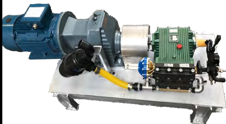
PIC 2:TPS - C110 BUILT